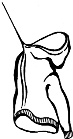
Hood and neck drawstrings can become entangled on playground equipment, cribs, and other common items.

Two strangulations occurred in cribs. In one case, an 18-month-old child was found hanging from a corner post of his crib by the tied cord of the hooded sweatshirt he was wearing. Another little girl was hanged by the drawstring of her sweatshirt in her crib the first time she wore the sweatshirt.