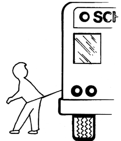
Waist drawstrings can become entangled in a bus door.

A 14-year-old boy was killed when the long, trailing drawstring on his jacket got caught in the closed door of a moving school bus and he was eventually pulled beneath the bus and run over.